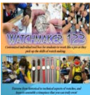
L1M2: Watch-Maker 123