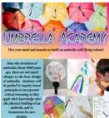
L1M1: Umbrella Academy