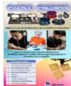
L2M1: Earbud Engineer

Students will explore science and math concepts in a creative, hands-on way by designing and building functional items like watches, umbrellas, and ear-buds. Best of all , they'll get to take home most of the products they create!