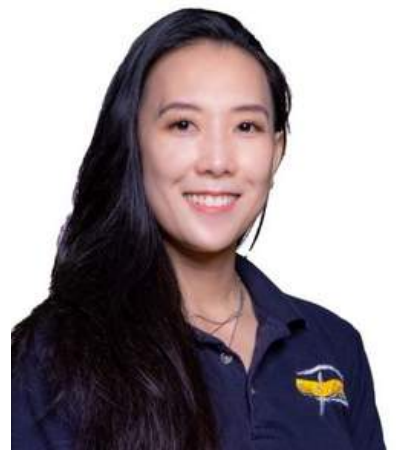
We Need You

This journey is ours to share. Whether you're keen on attending events, offering feedback, or lending a helping hand, your role is vital in weaving the rich tapestry of our Rosyth family. A heartfelt thank you for your unwavering support. Let's roll up our sleeves and make 2024 a year brimming with joy, learning, and community spirit.