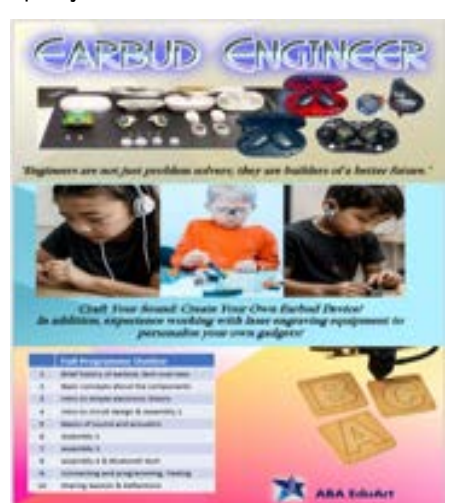
L2M1: Earbud Engineer

Our ABA STEM course Students will learn science and math related topics when they think outside the box to work on building functional watches, umbrellas, ear-buds, and at final stage tablets for coding. BEST yet the students will be able to bring back most of the functional products that they build!