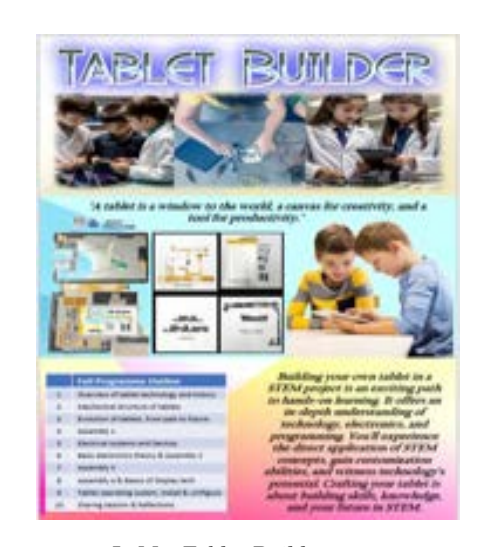
L2M2: Tablet Builder

To register via Whatsapp: sms to 90189413 a picture of the completed registration form. Then make payment to A.R.C. Centre according to the details as shown on the last page of this Prospectus.