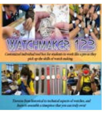
L1M2: Watch-Maker 123