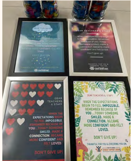
Appreciation notes to the staff

During the year, the PSG had organised and packed gifts of herbal tea, coffee, and encouraging notes to the staff to let them know that their efforts were very much appreciated