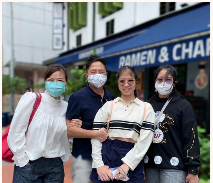
Serene with hubby and 2 grown up ex-Rosythian daughters!

"I'll say, if you have the time, energy and interest, just go for it! Some parents are concerned that one needs to have an outgoing personality, or to have plenty of spare time on hand, or to have plenty of ideas to contribute, to be part of EXCO. Therefore, they may be hesitant. For me personally, my interest and desire to be involved overshadowed these concerns"