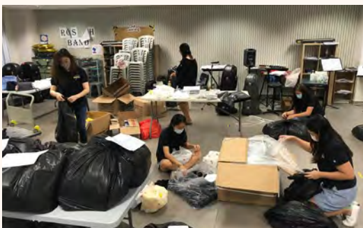
Packing behind the scenes

"A bad day with coffee is better than a good day without it"