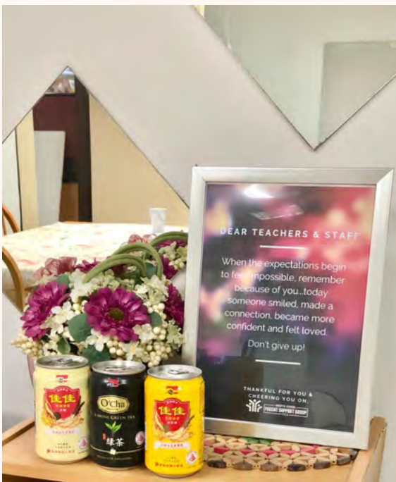
Herbal tea with flowers to brighten up the day