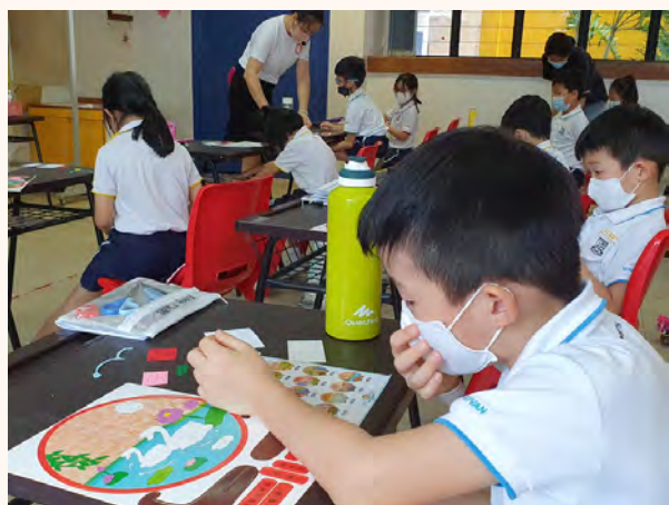
Art and craft