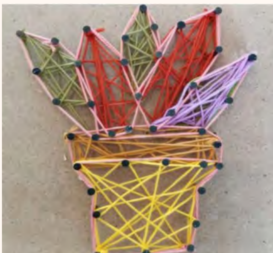
Beautiful finished product

In June 2021, as we were still under the constraints of the social distancing measures, the PSG was unable to organise any physical programs. However, we put together a very well attended virtual handicraft session that was meant to be a bonding session for parent and child.