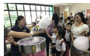
Children's Day celebrations