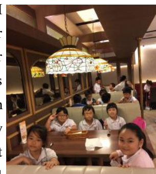
All ready to put into practice what they have learnt

The kids were ushered to Swensons, where each of them had their own lunch set, and practised the proper way of handling their cutlery for their soup, salad and steak. As one child quipped "Now I finally know which fork is for the salad and which one is for the steak, and which knife is the butter knife!" The children were closely supervised by their mentor to ensure that their napkins were placed properly and that their cutlery were in the correct positions after the meal.