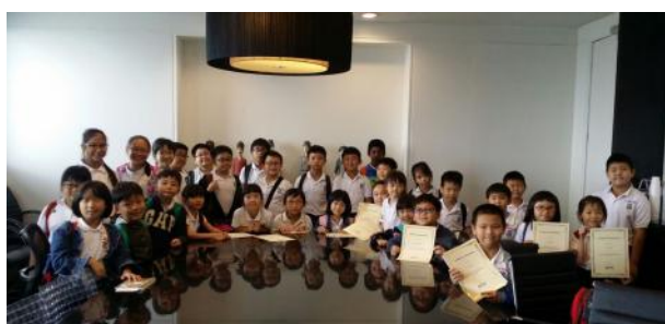
All showing off their certificates proudly

The children set off from school to the office tower in